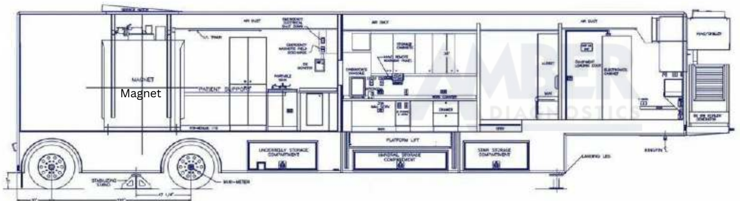
Mobile MRI Blue Print back view